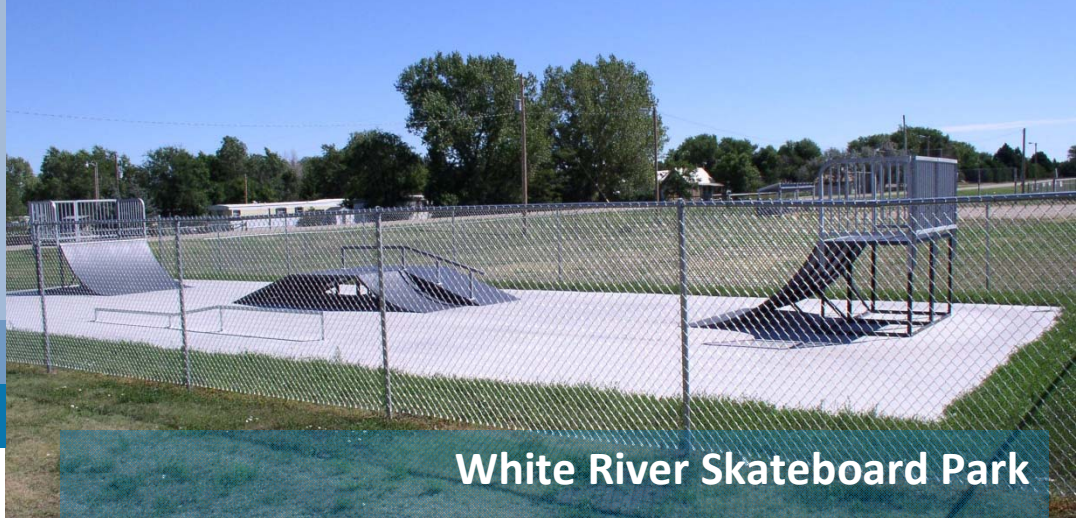
White River Skateboard Park

Partnerships Serving America's Communities