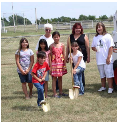
A group of skateboarding enthusiasts breaking ground for the skateboard

A goal of the South Central RC&D Council is to work with youth groups and partners to develop recreation systems that can be integrated with the dimensions of rural community life to promote active and healthy living for kids and adults.