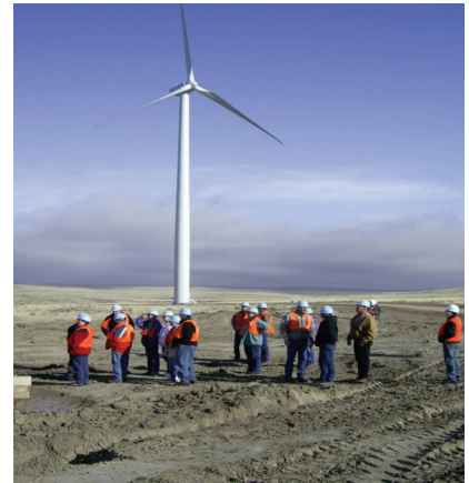
Landowners tour a local wind farm near Glenrock Wyoming