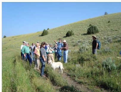
Wildflower and weed walk in Porcupine Wildlife Mgmt Area.

Since 2004, the committee's focus on education has provided on-site weed management assistance to hundreds of landowners, hosted a variety of educational seminars, and provided outreach on the importance of noxious weed management to local citizens through local newspapers, radio, a website, billboards, and participation in community events.