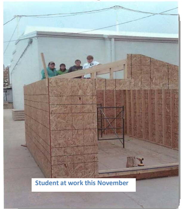
Student at work this November

As each set of drawings were completed, students used these drawings to guide them as they built the shed. Students measured, cut, staged and installed floor joists, walls, roofs, rafters, sheeting, metal sheeting, double door, window, and electrical wiring. Students turned the completed shed over to Western Lumber for sale. This shed project represents the first time that CJI students experienced the design and build process to complete a construction project.