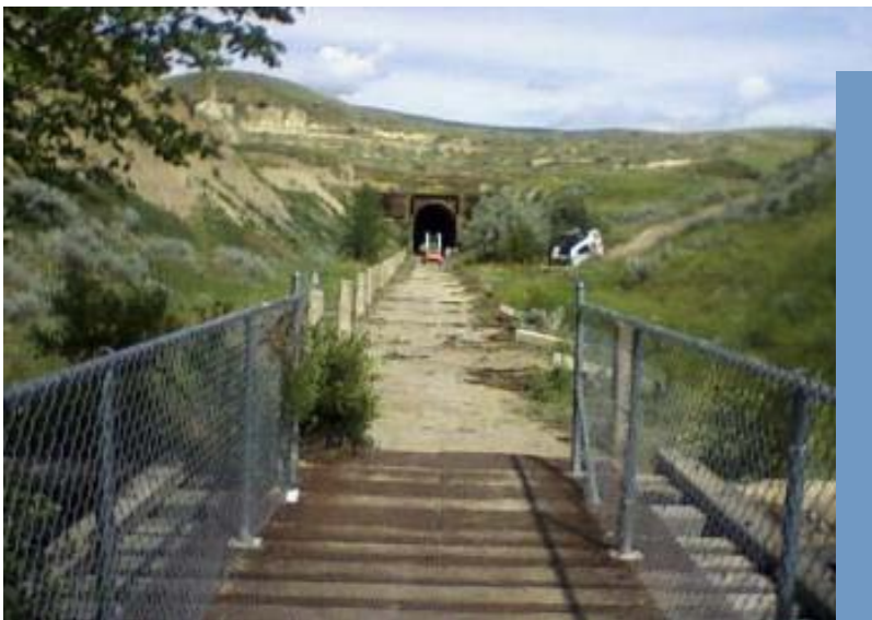
A barrier fence installed to deter vehicle use