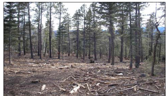
Post Treatment and Post-Skidding Area