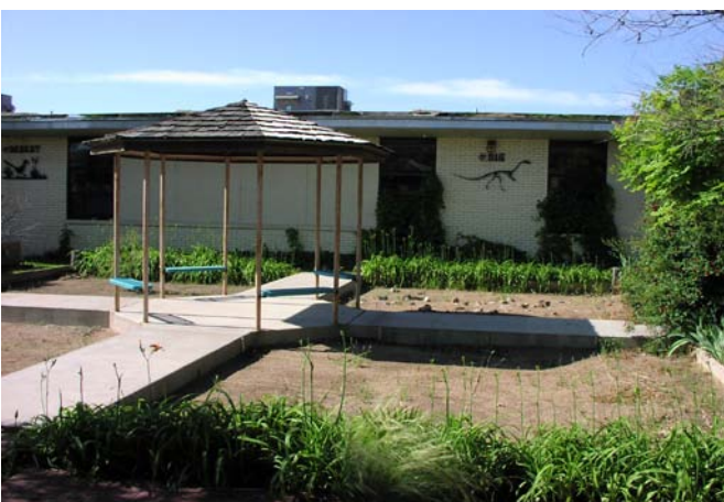
Archeological Dig Area