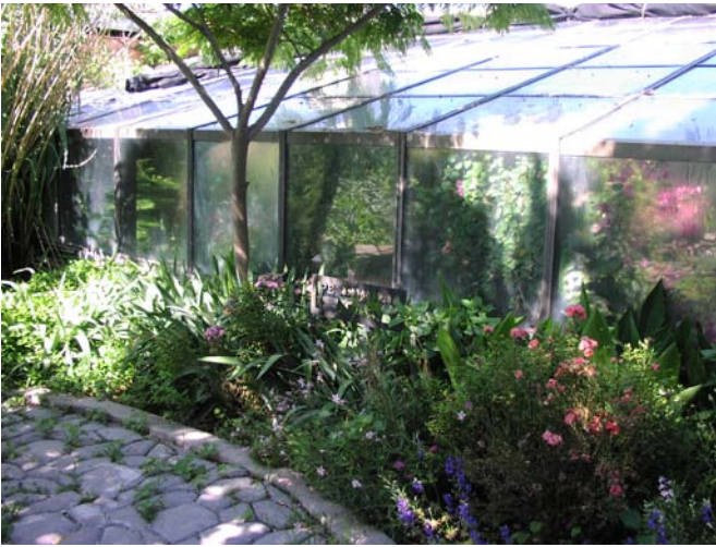
Green House Tropical Environment