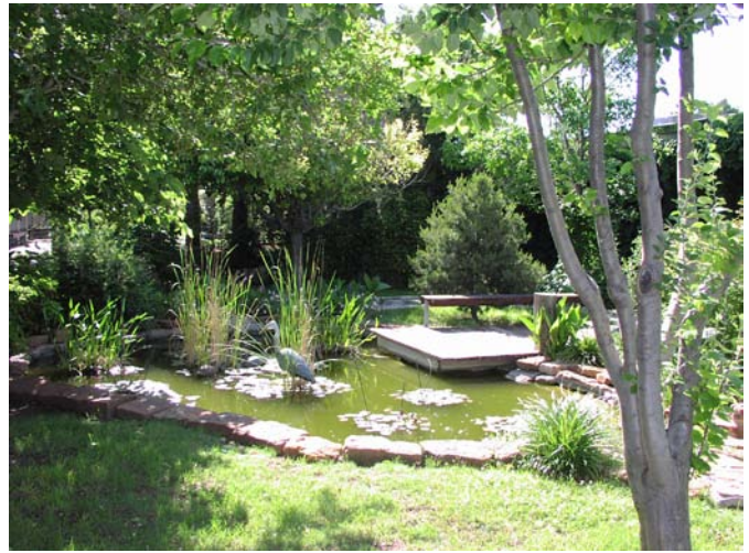
Wetland Area with Pond