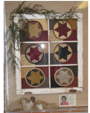
Quilt squares displayed by a local artist.

Art education plays an important role in the student curriculum at the Cavalier High School. It fosters self-discipline and confidence and imparts a sense of pride in self-expression. Each year the Cavalier High School holds a spring art show to showcase the range of artwork and talent among the students. At the spring art show, at least one talented student is given honors and receives a spot in the art gallery to display their artwork. The art gallery also has a display for local artists in the community to showcase their talents. This display is changed on a monthly basis.