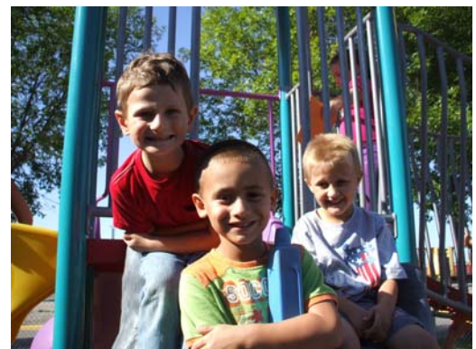
The kids enjoy the state of the art playground equipment at the center's fenced-in play yard.