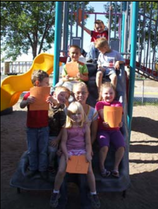
Pick a number, any number. Fun with Fitness!

The U.S. Department of Agriculture (USDA) prohibits discrimination in all its programs and activities on the basis of race, color, national origin, age, disability, and where applicable, sex, marital status familial status, parental status, religion, sexual orientation, genetic information, political beliefs, reprisal, or because all or a part of an individual's income is derived from any public assistance program. (Not all prohibited bases apply to all programs). Persons with disabilities who require alternative means for communication of program information (Braille, large print, audiotape, etc.) should contact USDA's TARGET Center at (202) 720-2600 (voice and TDD).