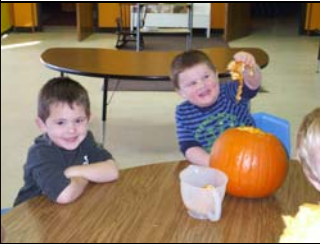
It's Pumpkin Carving Time!