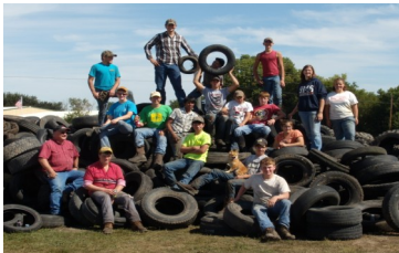
Ord FFA Chapter