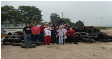
Greeley FFA Chapter