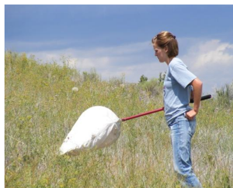
Sweep nets were used to collect on the insectaries created from previous releases.