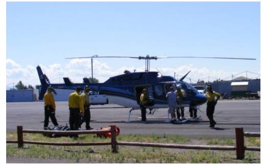
Forest Service Helicopter preparing for Bug Bomb drops along the Ashton Hill.

High Country RC&D 302 Profit Street Rexburg, ID. 83440 www.hcountryrcd.org Phone: (208) 356-5213 ex 5 Fax: (208) 356-7240