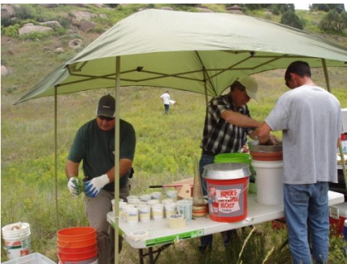
Collection Station: bugs were sorted counted, and packaged for redistribution.

Project funds continue until 2012 and hopefully longer until biosaturation has been accomplished and we are confident the invasive weed is manageable. The ongoing war against Leafy Surge is not won yet, but “Holding the Line” has definitely “ramped up” our attack.